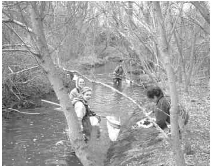
Teachers and College Student Assistants practice sampling for benthic macroinvertebrates at the LaMotte and Hach Certification workshops March 22, 2003.