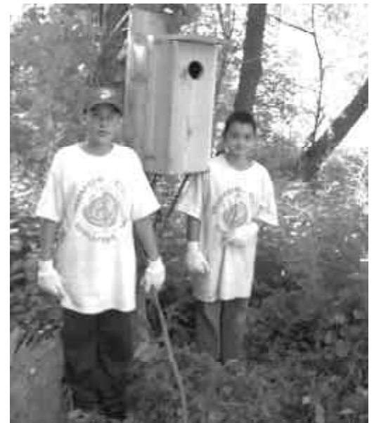
Rouge Rescue volunteers in Wayne constructed birdhouses last year to increase wildlife habitat.

Please make safety the primary consideration as you make decisions regarding monitoring, especially if the river is flooded on Spring Monitoring Day.