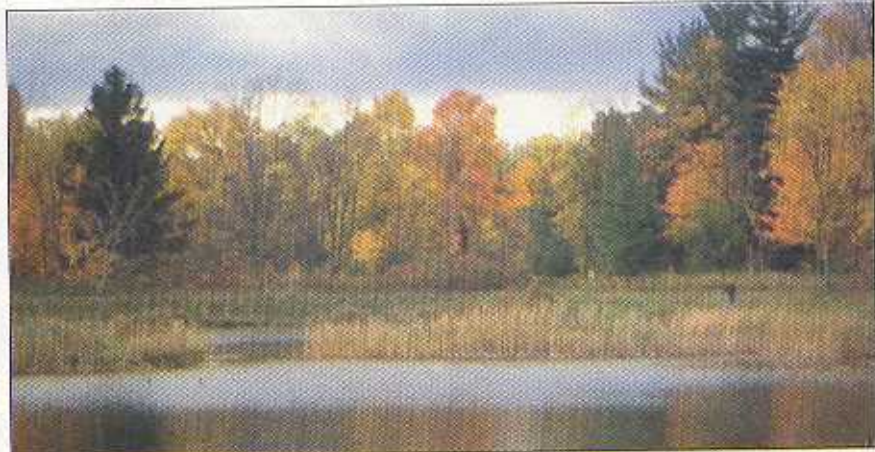
The project's watershed process provided regulatory flexibility and allowed local communities to address environmental programs on a site-specific basis.

When not maintained properly, onsite sewage disposal systems, or septic systems, also negatively impacted the Rouge River. With more than 17,000 systems in the watershed, failure rates were as high as 20 percent. In 1999, Washtenaw and Wayne counties enacted new ordinances for the management of onsite disposal systems. The regulations require the inspection of all residential systems by private evaluators when a property is sold. In 2001