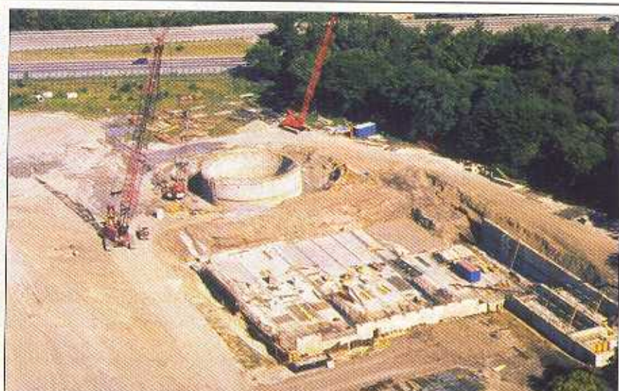
Left: Stormwater and nonpoint source pollution control systems, like this stormwater retention basin, were designed in conjunction with CSO controls. Right: CSO controls include sewer separation, storage transport tunnels, and variations on the conventional storage-treatment scheme.

lished through the National Pollutant Discharge Elimination System (NPDES) permit: